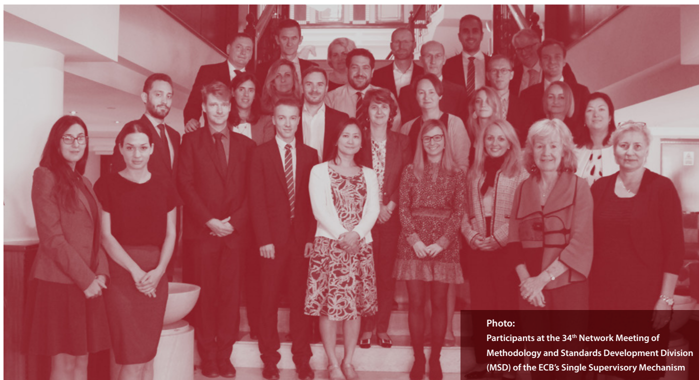
Photo: Participants at the 34 th Network Meeting of Methodology and Standards Development Division (MSD) of the ECB's Single Supervisory Mechanism

letters to be communicated, IT Supervisory Review and Evaluation Process (SREP) lessons learnt, proposed SSM Manual updates, Liquidity Drafting Team work on Pillar 2 measures, to SREP decisions outcomes and a comprehensive calibration proposal in relation to the different SREP elements.